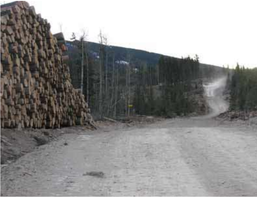
Lusk Creek Trail (part of the Trans Canada Trail) in Kananaskis