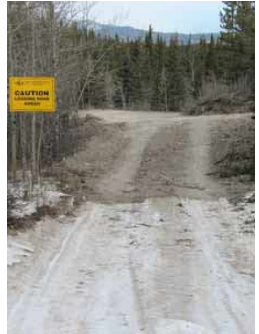
Old Baldy Pass meets Lusk Creek Trail