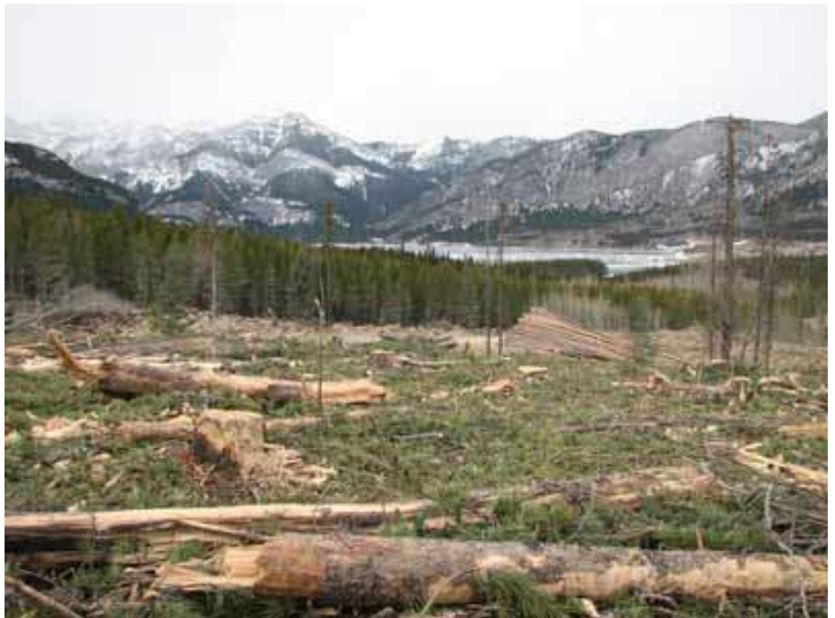
The photo above left is a trail map about 4 kilometres up the Lusk Creek Trail/logging road. It is surrounded by logging equipment and sports a Trans Canada Trail sign. The clearcut at right overlooks beautiful Barrier Lake.